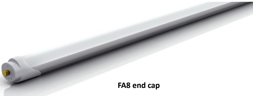
FA8 end cap