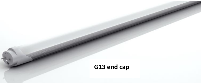
G13 end cap